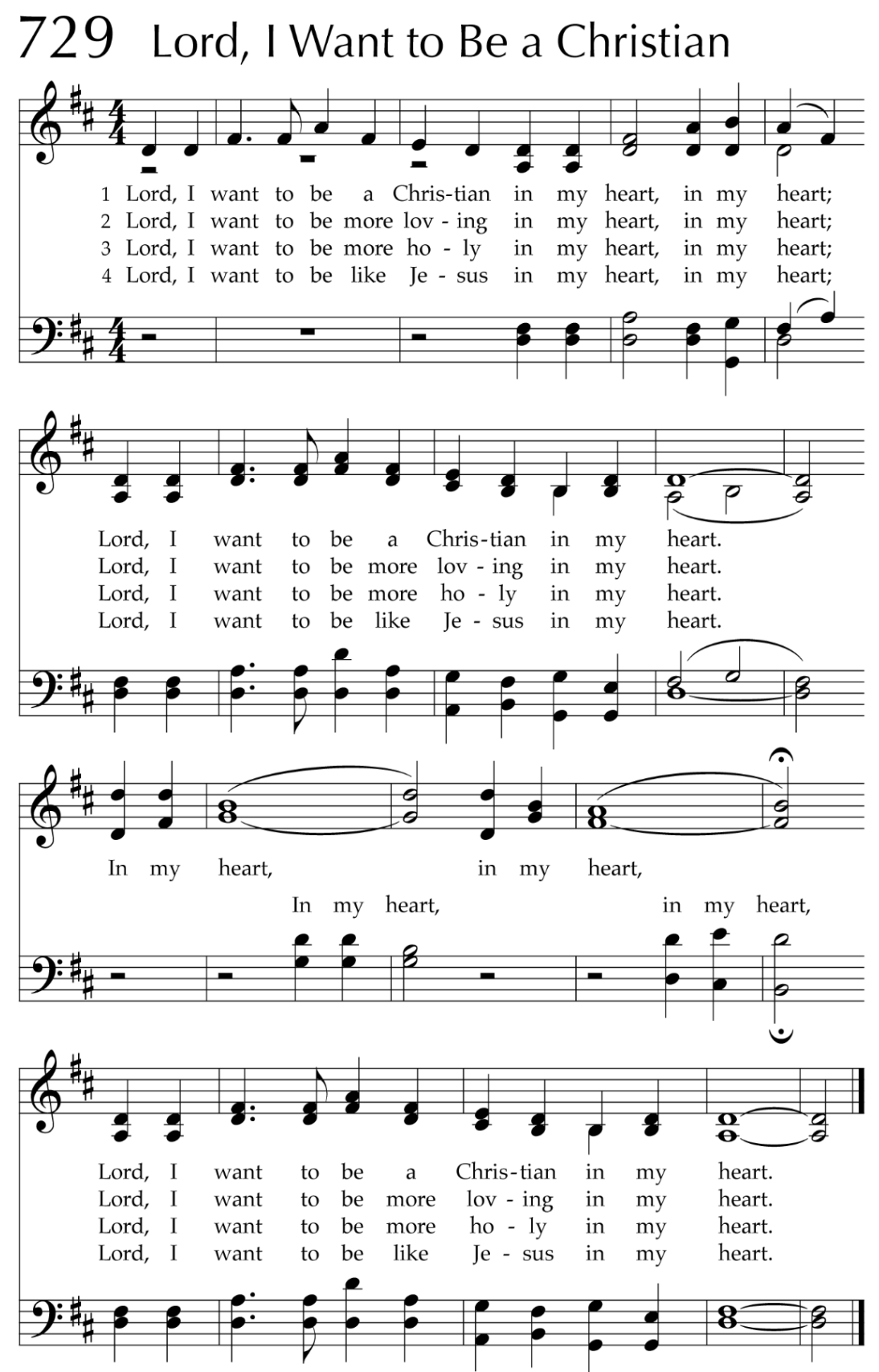
Through its recurring phrase, "in my heart," this poignant African American spiritual expresses the desire that our professed faith will not be superficial or hypocritical but will permeate the very center of our being, so that we may truly be the people God calls us to be.